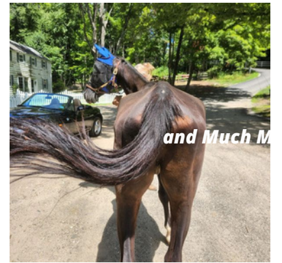
BRANDY on intake

In late August of 2022, Rising Starr received a call about a sanctuary in New Jersey called Twist of Fate. The owner of Twist of Fate had ceased taking care of the animals on the sanctuary. Dozens of animals were left starving and without access to any water. Hoorah and Brandi came to Rising Starr extremely underweight. On a scale of 1 to 9 Hoorah and Brandi were a 1. They were given a 20% chance of survival by our veterinarian. They are the most amazing kind horses. We are desperately looking to find them a forever home. They are both healthy, happy, and a joy to be around. Sound, no medication is necessary other than love and good food. The journey for these horses has been one of the most horrific cases we have seen. These two souls have not only gained weight but have found a relationship with each other that is tangible. You can see it and feel it. They are finally ready for adoption. But.. they must find a forever together. We have had many inquiries on Hoorah. He is never without his lady. It's most likely the only anything he has ever had. So these two magic horses are looking for a together forever.