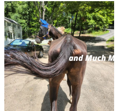
BRANDY on intake

In late August of 2022, Rising Starr received a call about a sanctuary in New Jersey called Twist of Fate. The owner of Twist of Fate had ceased taking care of the animals on the sanctuary. Dozens of animals were left starving and without access to any water. Hoorah and Brandi came to Rising Starr extremely underweight. On a scale of 1 to 9 Hoorah and Brandi were a 1. They were given a 20% chance of survival by our veterinarian. They are the most amazing kind horses. We are desperately looking to find them a forever home. They are both healthy, happy, and a joy to be around. Sound, no medication is necessary other than love and good food. The journey for these horses has been one of the most horrific cases we have seen. These two souls have not only gained weight but have found a relationship with each other that is tangible. You can see it and feel it. They are finally ready for adoption. But.. they must find a forever together. We have had many inquiries on Hoorah. He is never without his lady. It's most likely the only anything he has ever had. So these two magic horses are looking for a together forever.