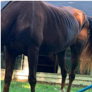
HOORAH on intake